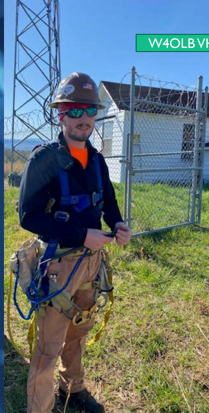
W4OLB VHF Antenna